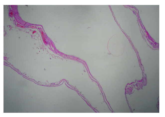
Figure 2. Dilated lymphatic gaps in cystic mass, hematoxylene-eosine staining.

Etiology of lymphangiomas remain unclear and they are mostly seen in infants and children. Most commonly involved areas are neck (75%) and axilla (20%). Less than 5% of lymphangiomas are found in the intra abdominal region [1-4]. Lymphangiomas can arise from the mesentery, retroperitoneum, colon, small intestine, pancreas, omentum, mesocolon and gallbladder. Intra abdominal lymphangiomas might be asymptomatic or present with nausea, vomiting and abdominal fullness. The symptoms are due to either pressure on the adjacent structures by the enlarging mass, or to complications as hemorrhage, infection, perforation, torsion and rupture. Lymphangiomas might cause problems in the pre-surgical staging of solid tumors especially with cystic or mucinous nature. Hence, many of the previously reported cases were diagnosed incidentally during surgery. A retroperitoneal cystic lymphangioma was diagnosed co-existing with a sigmoid carcinoma in a 78-years old man in the report by Papadopoulos [6]. Patient was treated curatively and exact diagnosis of lymphangioma was given postoperatively as in our case. Ultrasonography, CT and MRI have been shown to be complimentary in the diagnosis of retroperitoneal lymphangiomas [7].