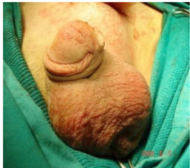
Figure 3. Postoperative picture

gonadal dysgenesis (n=1) and endodermal sinus tumor (n=1). Five of the prostheses were saline-filled and 6 of them were silicone gel-filled. There was no information about the type of 7 prostheses. Nine prostheses were placed by inguinal approach and 9 were placed by scrotal approach. In scrotal approach the prosthesis was inserted into the scrotum by a scrotal incision and fixed to the Dartos Fascia by 3-0 polyglactin suture. In inguinal approach the prosthesis was inserted into the scrotum through an inguinal incision. A scrotal pouch was created by finger dissection and the prosthesis was fixed to the Dartos Fascia by 3-0 polyglactin suture (Figure 1, 2 and 3). There was no complication during operations. None of the patients had antibiotic prophylaxis. Postoperatively 7 patients were given sulbactam-ampicillin, 3 were given trimethoprim-sulfamethoxazole and 1 was given amoxicillin-clavulonate including oral antibiotics for 1-week period. The two