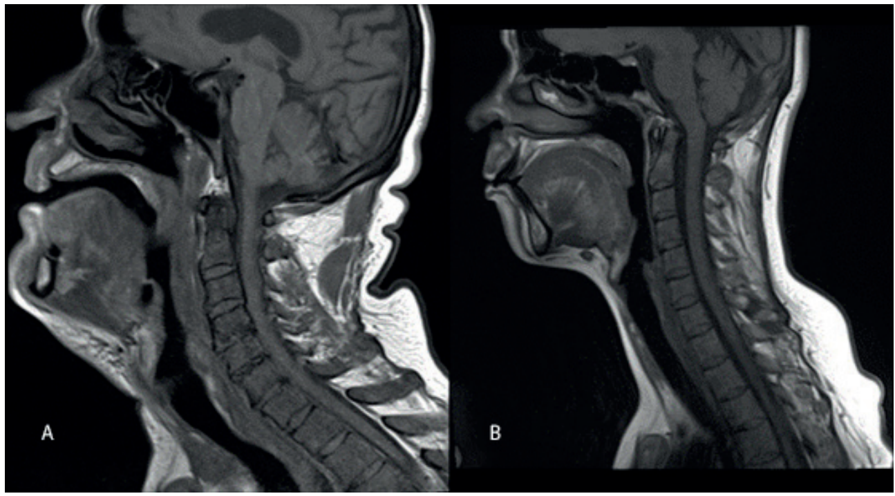
Figure 1. A , 86 years old man with deep neck infection, Sagittal T1weighted image of cervical spine shows bone marrow signal alterations, he was diagnosed acute myeloid leukemia with bone marrow biopsy (the bone marrow is diffusely abnormal). B , 36 years old woman with neck pain and lumbago, signal alterations in the bone marrow that are suspicious in terms of infiltrative diseases, she was diagnosed osteomalacia at follow up (the bone marrow is diffusely abnormal).

proven marrow infiltration compared with normal subjects [11]. In early stage multiple myeloma and monoclonal gammopathy of unknown significance, findings on MRI correlate with earlier onset of more aggressive disease, especially using dynamic MRI techniques [12-15]. Most of the diagnosis patients were multiple myeloma. Patients with diffuse signal alterations detected as incidental of bone marrow on MRI should be examined especially for multiple myeloma.