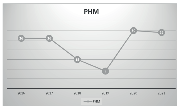
Figure 2. Distribution of the number of PHMs by years

Chi-square test ( \chi^2 ) was used for categorical variables.