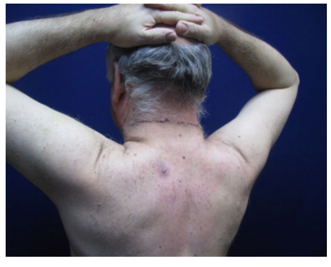
Figure 4: Postoperative view