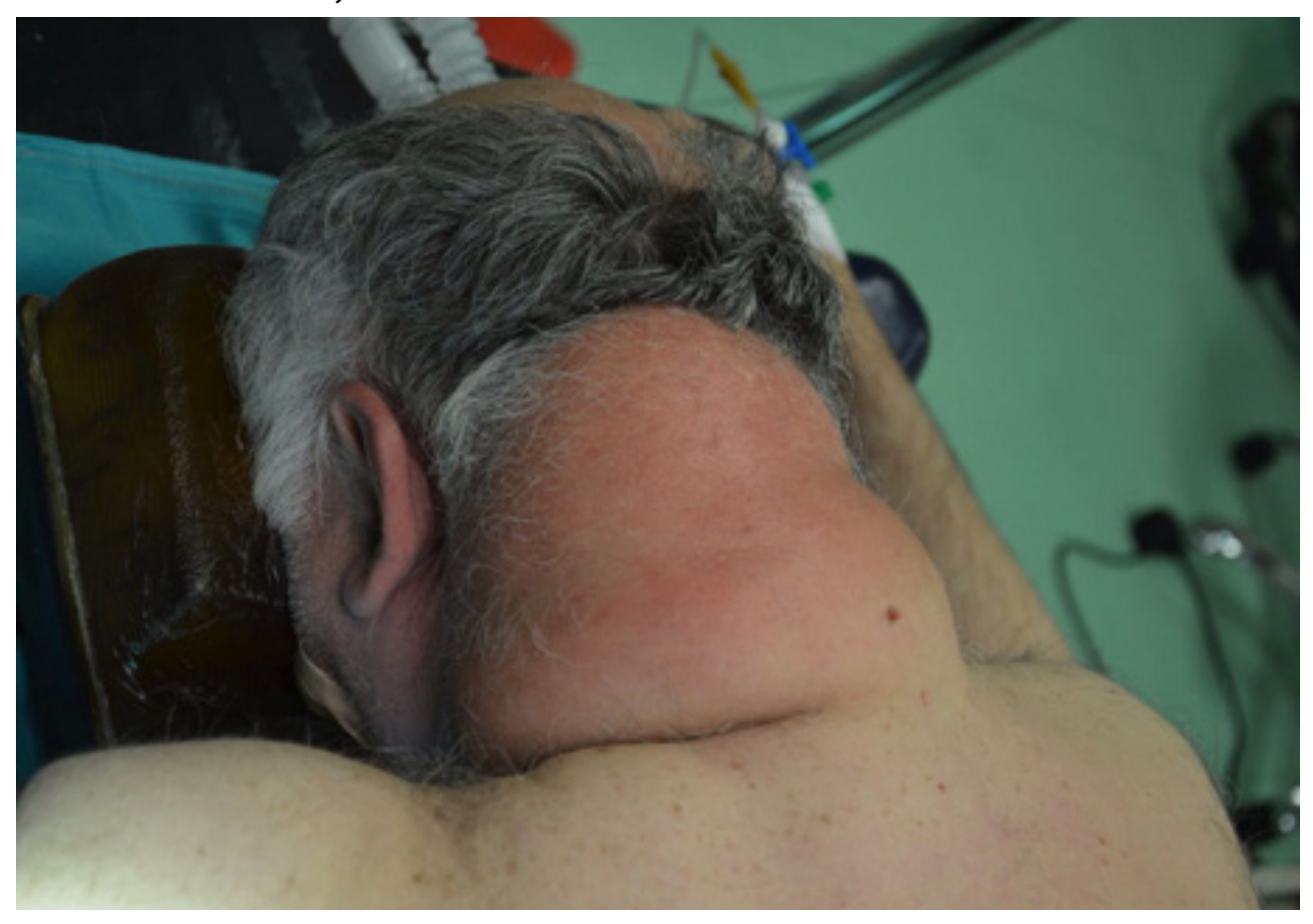
Figure 1: Giant lipoma located at the back of the neck.

that the patient underwent an excision of a small tumor from the back of the thorax 15 years ago. Physical examination revealed a soft, mobile, painless giant tumor filling the posterior cervical region (Figure 1).