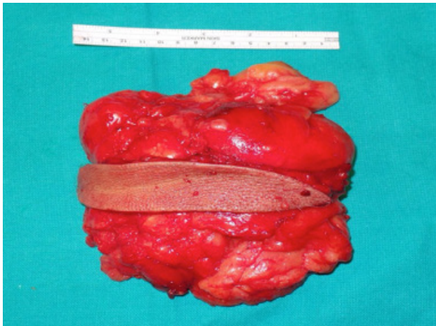
Figure 3: Excised lipoma with skin island.

Patient was operated under general anesthesia with preliminary diagnosis of lipoma. An eclipitic incision parallel to skin folds was designed and encapsulated lipoma with a small skin island was excised in one piece (Figure 3). One Jackson-Pratt drain was placed to prevent hematoma and it was removed 2 days later. No postoperative complication has been seen (Figure 4) and the pathology report confirmed preliminary diagnosis. There was no recurrence and the patient was symptom-free at his 21-month follow-up.