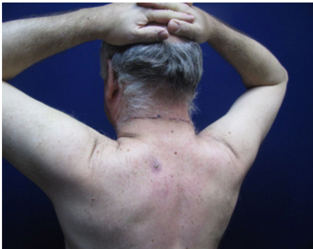
Figure 4: Postoperative view