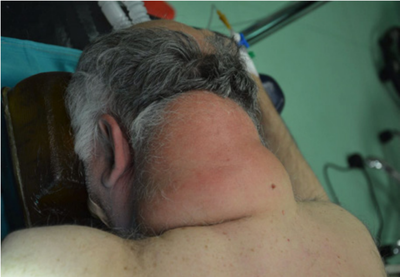
Figure 1: Giant lipoma located at the back of the neck.

that the patient underwent an excision of a small tumor from the back of the thorax 15 years ago. Physical examination revealed a soft, mobile, painless giant tumor filling the posterior cervical region (Figure 1).